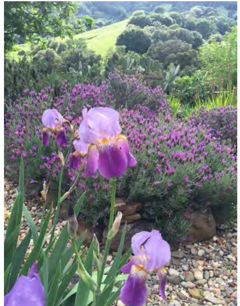
A winding gravel path dotted with bearded iris, lavender, and fruit trees leads to the bucolic hillside view.

What I love about Debbie's garden is how it reflects her unique personality, her love of the land, and her admiration for the history of the Wild West. As we ambled around the property with her happy dogs in the lead, the songbirds sang, a bevy of butterflies delicately landed on her flowers, and the koi in the pond swam to the surface to greet me. This time together immersed in this sustainable landscape nurtured my soul and brought our childhood memories to vivid life. Although we grow the same plants, shrubs, trees, and succulents in both of our yards, our designs and esthetics are completely different. And that's the beauty of creating a garden, making it your own special paradise where you can find peace, tranquility, and restoration in tandem with the wild kingdom.